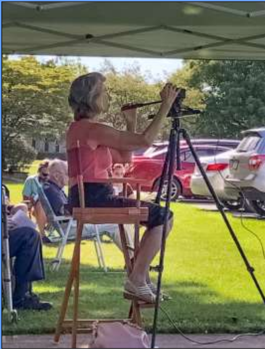
Lights, Camera, Stream! Our Apostles Videographer in her new Director's Chair!

If you are unable to attend Worship and have internet capability, you can access