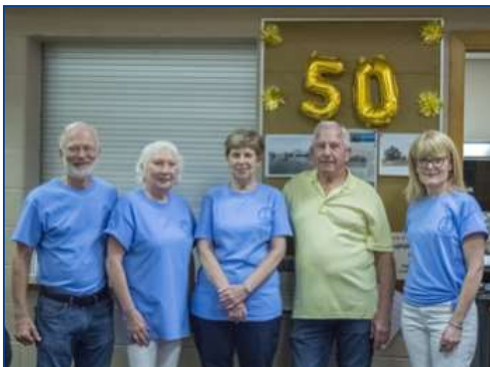
The 50 th Anniversary Team