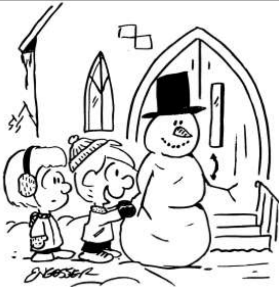
"He's today's greeter."