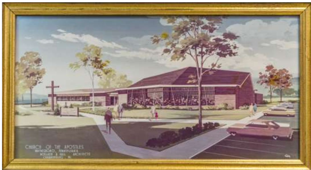
Architects Watercolor of the Church of the Apostles in 1967

A sign-up sheet is in the narthex for volunteers to help plan this milestone celebration !