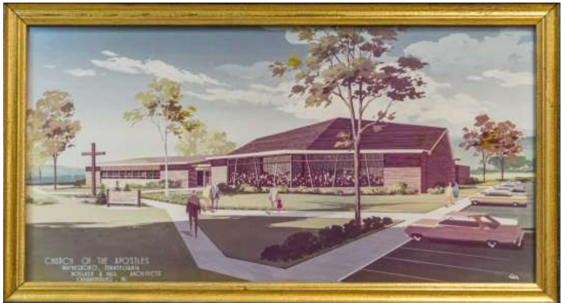
Architects Watercolor of the Church of the Apostles in 1967

A sign-up sheet is in the narthex for volunteers to help plan this milestone celebration !