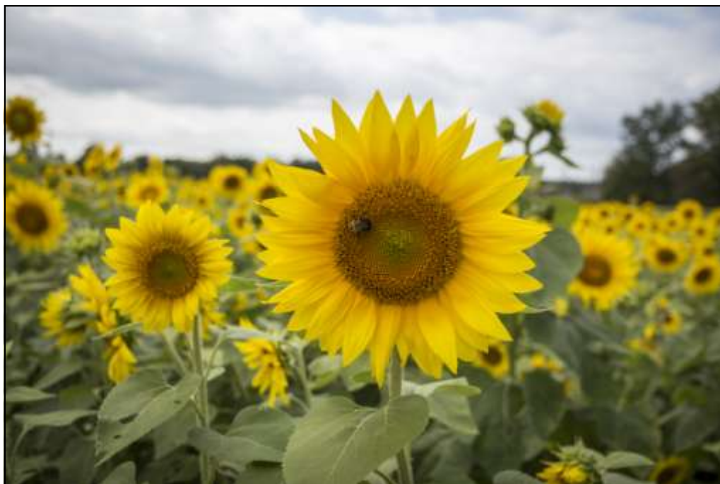
Sunflowers in Full Bloom