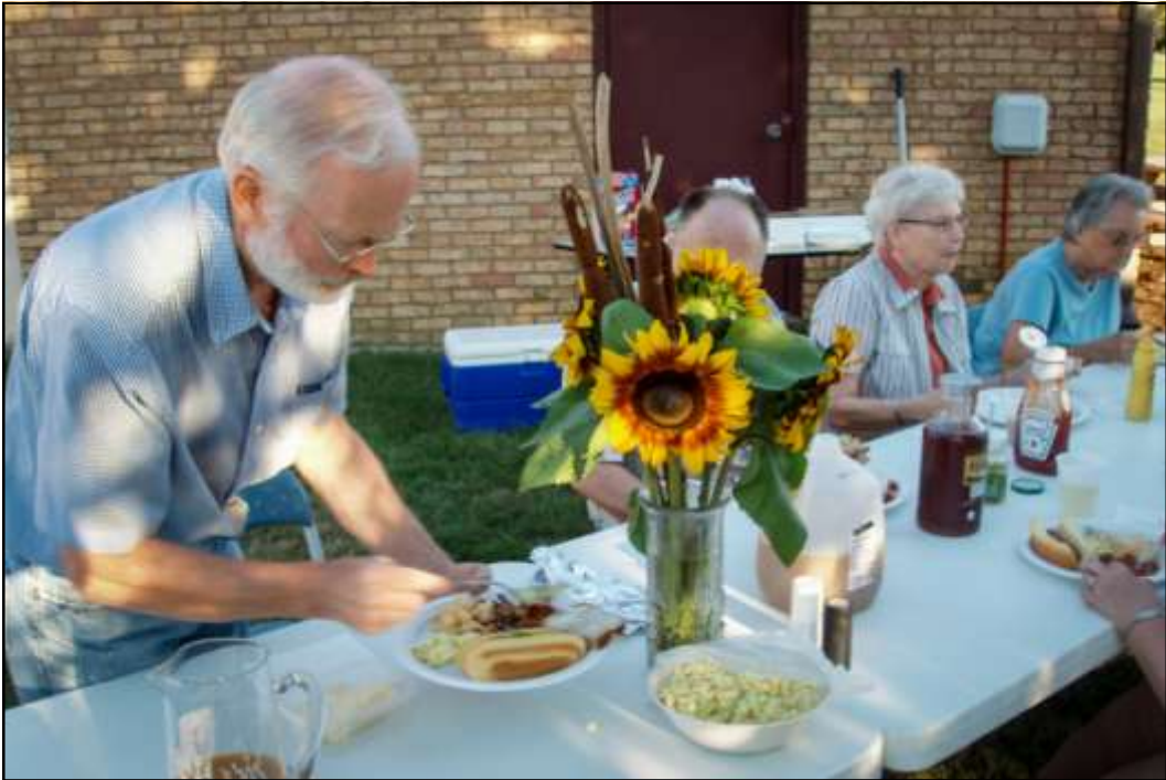
September 16 Community Gardner's Dinner