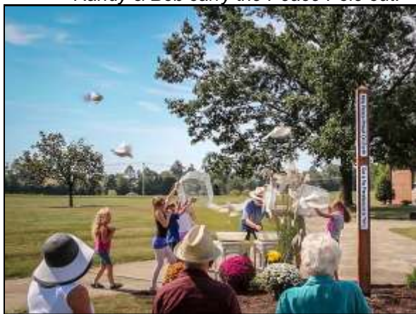
The children release the doves.