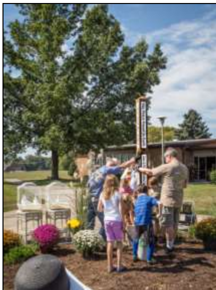
The children help to install the Peace Pole.