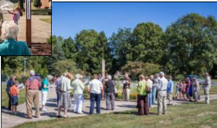
Our September 20 closing hymn, "Let There Be Peace On Earth" at the Peace Pole.

See more Peace Pole pictures on our website under Community Outreach and on our Facebook page.