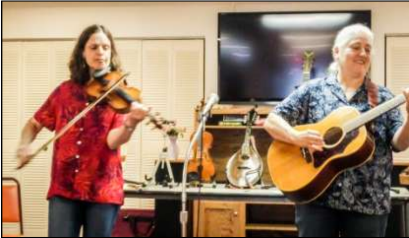
Concert at Trinity House