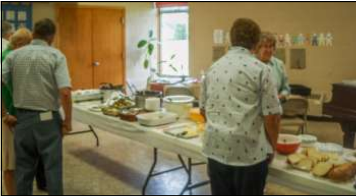
Potluck At Apostles